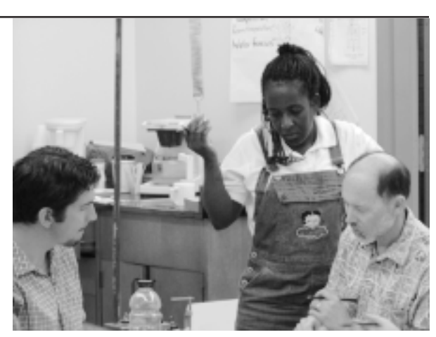
Engaging in the science - challenging our understanding and knowing what we understand. (Sacramento Area Science Project)

When students move a solar battery closer to a light source and when they add a bulb to the light source, are students correct to describe both of these as "intensifying the light on the solar battery?"