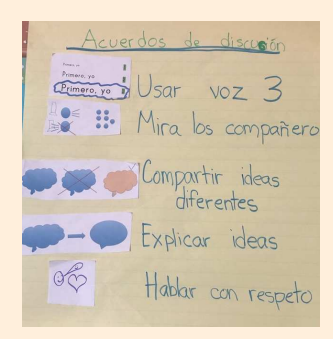
Kindergarten Math Discussions Agreements

The K/1 team has also been thinking of what it means to make student thinking visible in their classrooms. The kinder team has been focused on ways to make student thinking visible during number talks. They are working on one of the core Kindergarten math standards: decomposing numbers less than 10. They also continue to gamify their math lessons by having students engage in math menu games that reinforce concepts from their Japan Math lessons. If you're interested in seeing some of their games in action- follow this link!