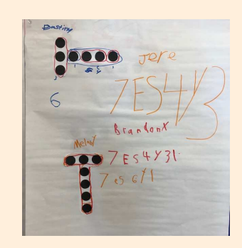
A kindergarten number talk in Mr. Delgadillo's Class, they are learning to decompose numbers less than 10.