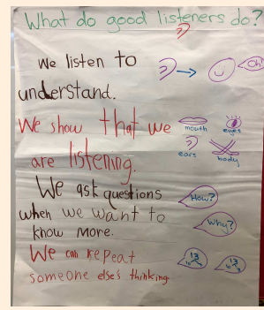
First grade student discussion norms at John Muir

The K/1 team has also been thinking of what it means to make student thinking visible in their classrooms. The kinder team has been focused on ways to make student thinking visible during number talks. They are working on one of the core Kindergarten math standards: decomposing numbers less than 10. They also continue to gamify their math lessons by having students engage in math menu games that reinforce concepts from their Japan Math lessons. If you're interested in seeing some of their games in action- follow this link!